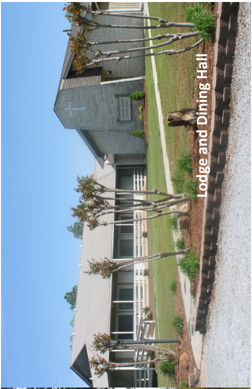
Lodge and Dining Hall

Rolling Hills Conference & Retreat Center 521 Highway 304 Calera, AL 35040