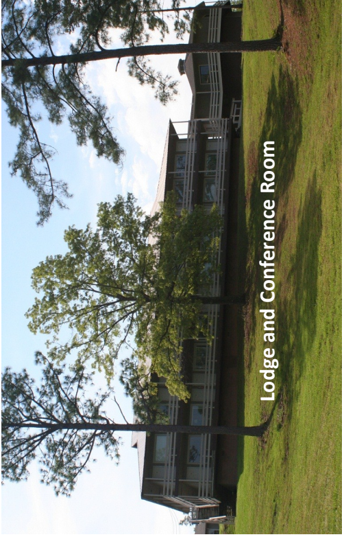
Lodge and Conference Room